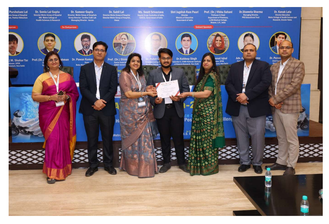
The P.R.S. Educational Trust felicitates all the committee members of conference.