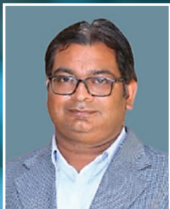
P.R.S Educational Trust Director's Message